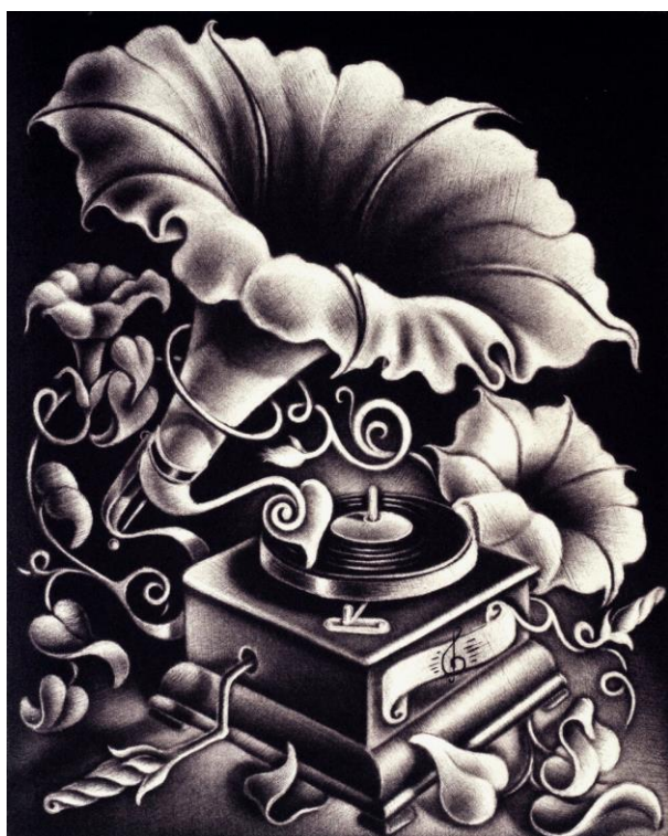
Vine-el Glory, 2020 Mezzotint engraving, 5 x 4 inches

BOSTON, MA – Carol Wax’s masterful mezzotint engravings depict the ordinary as extraordinary. Using dramatic lighting effects, exaggerated perspectives, and a dose of wit, Wax transforms commonplace objects into astonishing icons, cleverly revealing “the anima in the inanimate”.