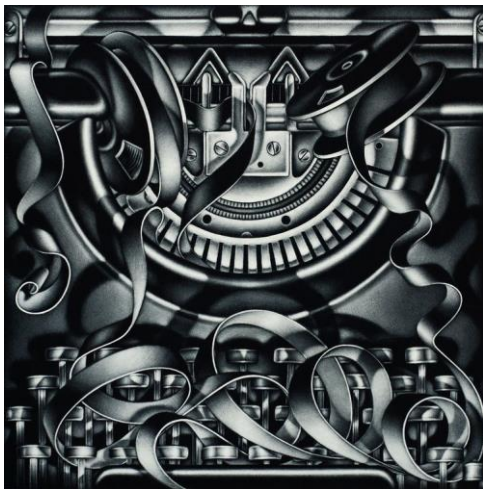
Type Face, 2002 Mezzotint engraving, 9 ¼ x 9 ¼ inches