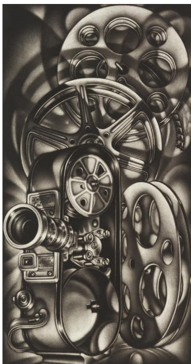
Photo Realism, 1999 Mezzotint engraving, 16 x 8 ½ inches

About Childs Gallery: Established in 1937 on Newbury Street in Boston's Back Bay, Childs Gallery holds one of the largest inventories of oil paintings, drawings, watercolors, prints and sculpture in the United States. We actively service collectors, artists, estates and corporate clients throughout the country in the buying and selling of fine art, and have placed exceptional works in major museums nationwide. Our extensive holdings – including prints and drawings that range from Old Masters to 20th century notables to 21st century contemporaries, along with superb paintings and sculpture from the past 200 years – are particularly appealing to the eclectic tastes of today's art lovers, as it's the collector's eye, not the historic period or medium, that makes for a cohesive and personally satisfying collection.